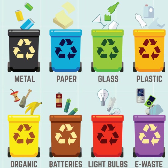
Types of Recyclable Waste